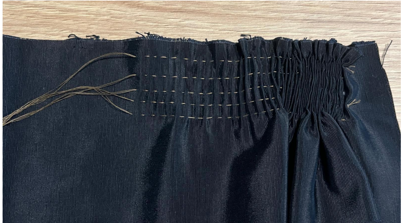
Sampler: The Gathering