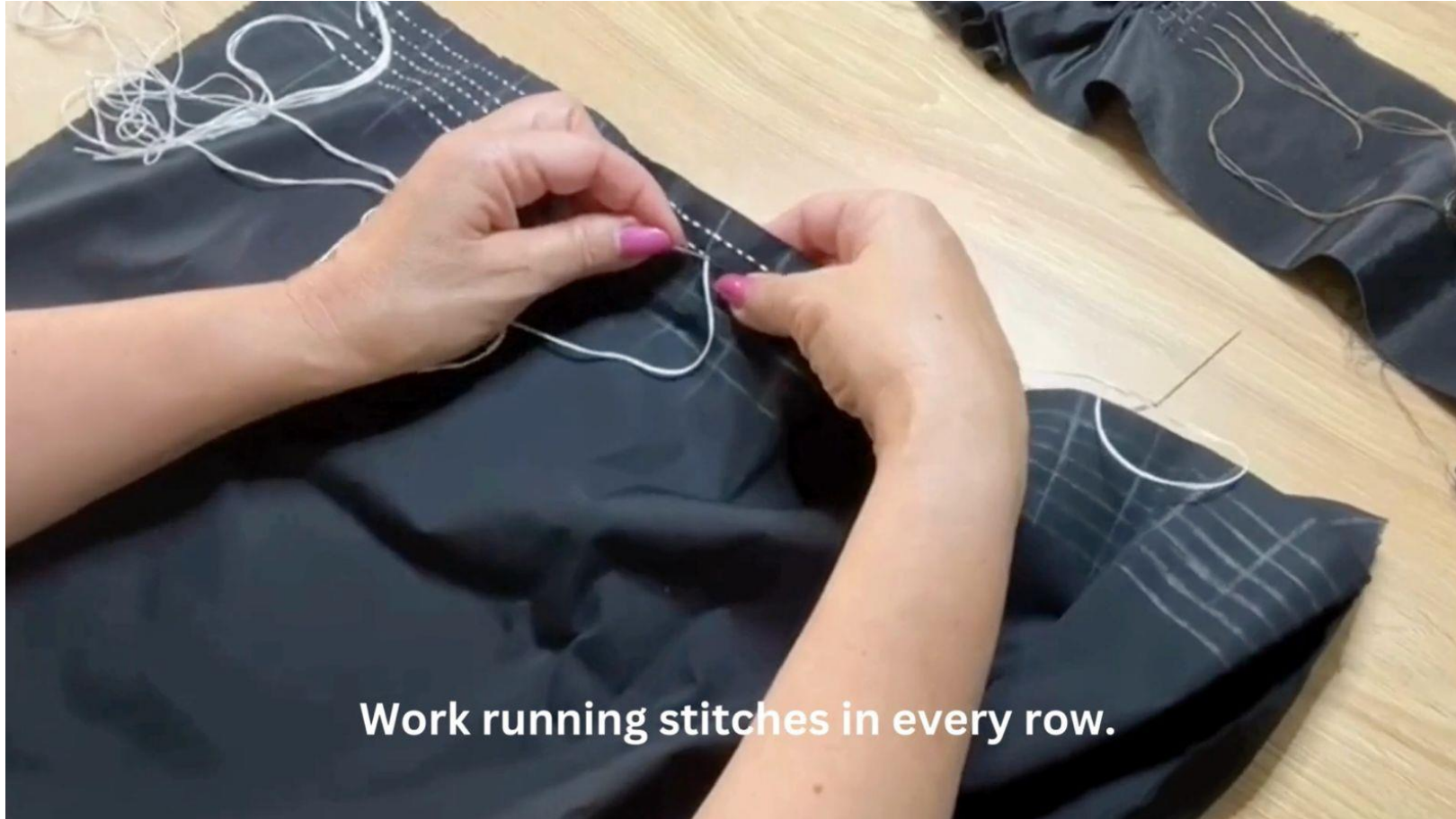
Work running stitches in every row.