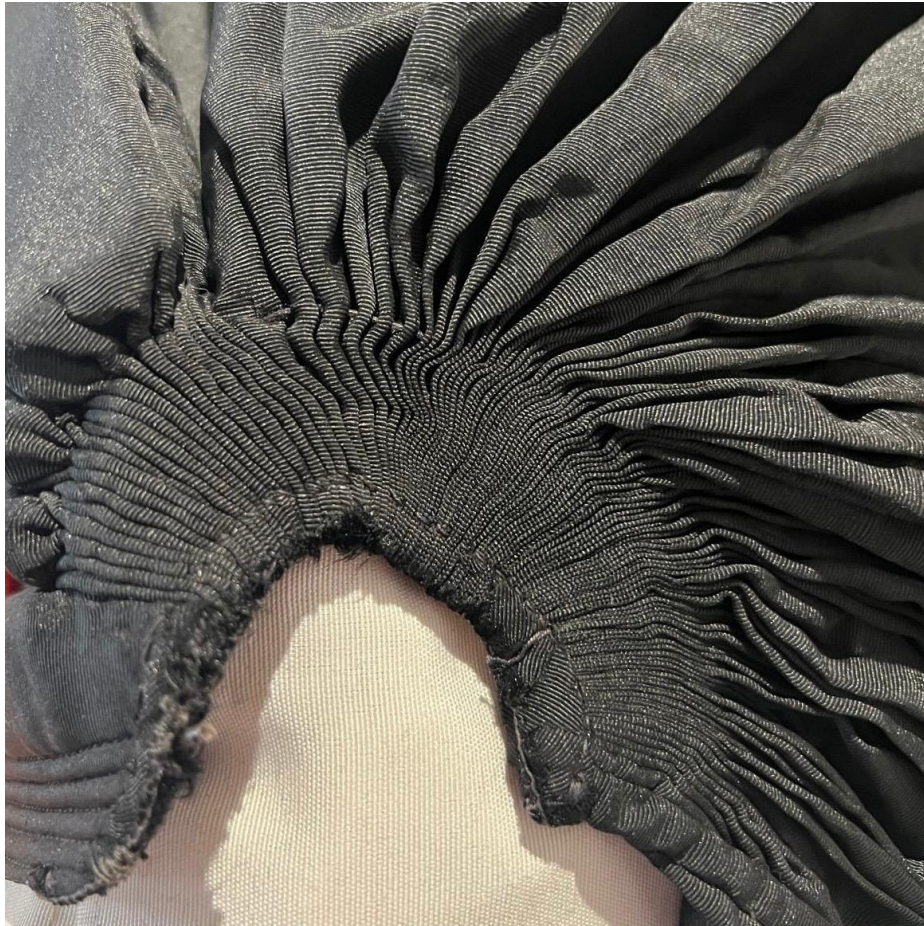
The gathered feature of the għonnella